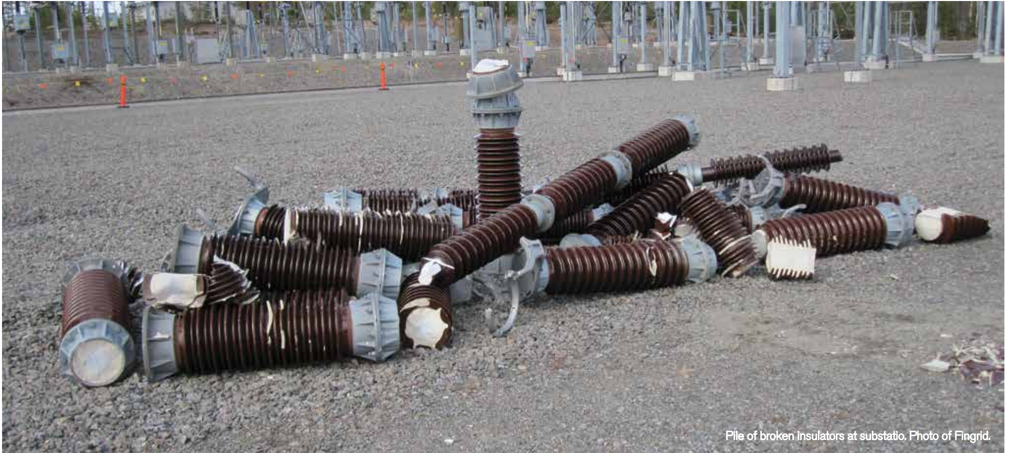
Pile of broken insulators at substation. Photo of Fingrid.